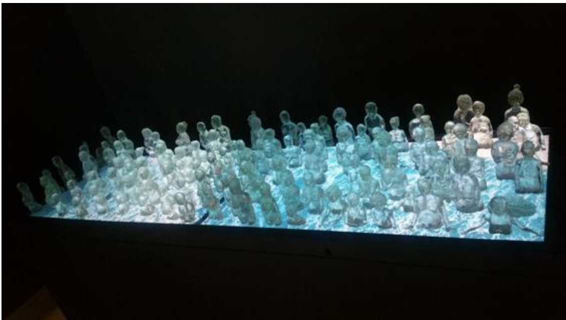
Figure 4. Wayan Upadana, “Manusia Imaji Air dan Cahaya”, 2018

...My approach to ecological thought can be characterised as something I call ‘dark ecology’. Dark ecology doesn’t mean the absolute absence of light....[it’s] the dimness. Light as such isn’t directly present, you can’t pin it down and you can’t fully illuminate it: what illuminates the illuminator?...In Tibetan Buddhism, the time between one life and the next is called the bardo, the ‘between’. All kinds of haunting images appear to the consciousness in that state, images based on past actions (karma). We feel that things are different now, that we are in a bardo-like transition space regarding ecological awareness.