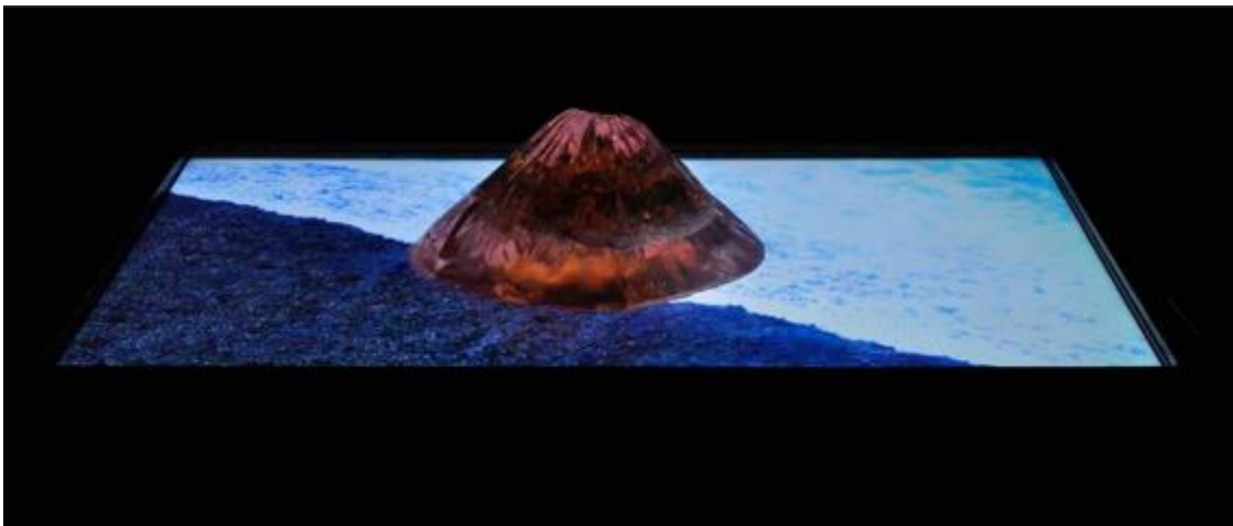
Figure 3. Wayan Upadana, "Memoscape", 2015

Parta stated that through the artworks' explorations in this exhibition, it seems to show how the art world is "questioning" itself in its modernity constellation, along with "differentiating" itself from the moral and science. This seems to be an interesting take on representing urban spirituality to the public audience. One of those artworks that are similarly giving water encounters was Wayan Upadana's "Memoscape" which had a resin based sculpture upon a LED TV showing moving waters on the shores and audio playing on the background. Parta explained,