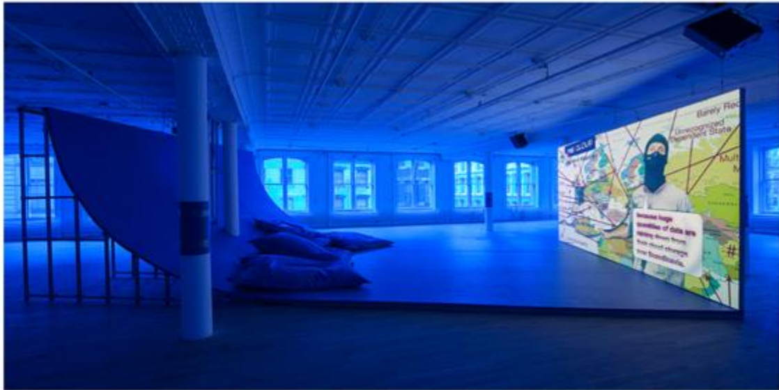
Figure 1. Installation View, 'Hito Steyerl' at Artists Space, 2015, showing "Liquidity, Inc." (2014)

namely: the weather, water, circulations, information, assets [2]. While following the ex-finance worker, you get to see all of these matters presented (or rather represented). And you watch it lying on a wave-like ramp, therefore you are in the waves of the liquid when watching it. So when it becomes a title of an artwork, especially having inc. (i.e. incorporated) in the end, you wonder what it is actually talking about.