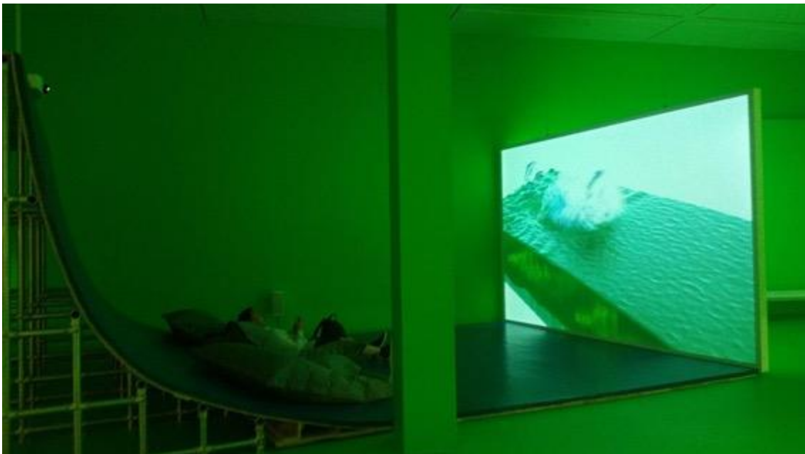
Figure 6. Hito Steyerl, “Liquidity, Inc.” at NTU CCA, 2019

I lay down on a blue martial-arts mat placed before the screen and let its story flow and crash. It crashes repeatedly—like waves, like our computers, like the economy. Twenty minutes in, all three of those crashes coincide, and desktop messages begin to pop up on the screen [18].