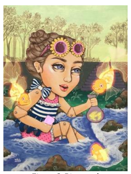
Figure 2. Riverpool

Technique : plaque, color grading, and shading