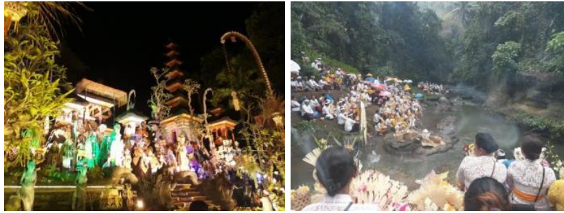
Figure 5. Temple ceremony, 2018 [Source: Photo by Wayan Karja]. Figure 6. Cremation ceremony, 2019 [Source: Photo by Wayan Karja].