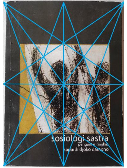
Figure 5. Steps A1 & A2 visual composition analysis