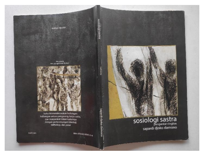
Figure 4. Sosiologi Sastra Pengantar Ringkas Book cover design by 369, 2013 Edition, in open position

Sosiologi Sastra, Pengantar Ringkas contains 108 pages, divided into 9 chapters, containing the description of the social situation surrounding literary thought