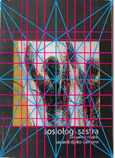
Figure 6. Step B visual composition analysis