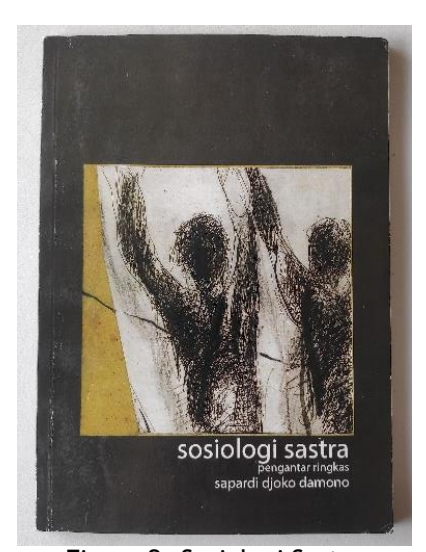
Figure 2. Sosiologi Sastra Pengantar Ringkas Book cover design by 369, 2013 Edition