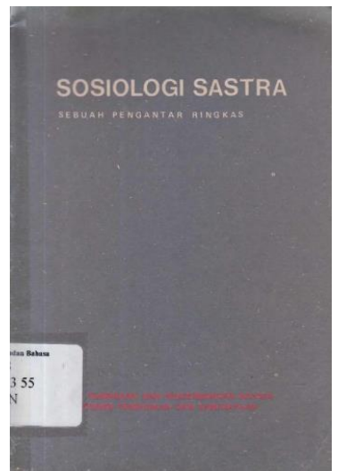
Figure 1. Sosiologi Sastra Pengantar Ringkas Book cover design, 1978 Edition

Schleiermacher's hermeneutic perspective sees the structure of the text as a means for the interpreter to enter the author's mental world. Considering that the object of study is a book cover design, it is necessary to initially indicate the described impressions so that the author's thoughts and the reader's interpretation can be understood. The book, Sosiologi Sastra Pengantar Ringkas , cover design by 369 works discussed here was published by Editum publisher in 2013 (Figure 2). This book's measurement is 15 cm wide and 21 cm high.