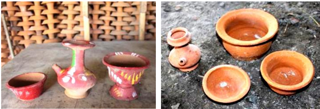
Figure 1. Some pottery made by Basang Tamiang craftsmen for Ceremonial equipment such as: coblong , caratan , pasepan , and bija container .

Pottery products made by Basang Tamiang pottery craftsmen are dominated by pottery products for Hindu religious ceremonies in Bali such as coblong , pasepan , jun pere , dulang , paso , pane , jun tandeg , caratan , jeding , and other products. In addition to the need for objects for ceremonies, craftsmen also make pottery for household and tourism needs such as mortars, flower pots, statues, wall hangings, ashtrays, decorative lamp holders, piggy banks, and others. These pottery products are made from red clay with a relatively low firing temperature. The types of pottery produced are still made manually without the help of machines, but are made using a simple rotating tool called pengenyunan (Warmadewi, 2024) [1]. This traditional rotating tool is also called pemubutan . This simple tool-making technique has been carried out by craftsmen from generation to generation, even though the era is modern, it is still maintained by the craftsmen. Pottery craftsmen in Banjar Basang Tamiang are generally dominated by elderly women, while men provide materials from the beginning to the firing process. In 2022, it was stated that Banjar Basang Tamiang consisted of 190 families (Suyatra, 2022). Here are some pottery craft products from Banjar Basang Tamiang, Kapal Village.