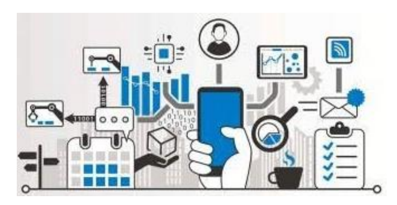
Figure 1 Machine Technology in Society 5.0

Being an interior designer is not only having the skills to channel creative vision in combining design elements in a composition, but interior designers as problem solvers require insight and creativity in seeing problems that are developing in today's society. The challenge for interior designers is how to see opportunities to create creative ideas in facilitating human activities and behavior in the space needed in the era of society 5.0. The current Indonesian interior industry through the use of machines to facilitate interior work. In society 5.0, interior designers will integrate machines and other artificial intelligence that are believed to help humans more optimally. So designers with several methods and approaches can focus on creating innovation and creating new ideas more actively