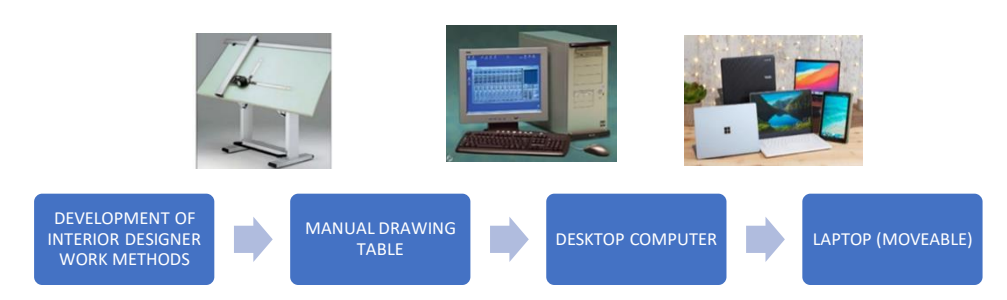
Figure 2 Interior Designer Work Method Diagram

Nowadays, computers are no longer only used as a calculating tool, more than that, computers are expected to be empowered to do everything that can be done by humans. Therefore, artificial intelligence is created and inserted into a machine (computer) so that it can do work like humans can do, for example the ability to answer customer diagnoses and questions, as well as handwriting, voice, face recognition and others. The main scope of artificial intelligence, artificial intelligence is created and inserted into a machine (computer) so that it can do work like humans can do, for example the ability to answer customer diagnoses and questions, as well as handwriting, voice, face recognition and others. The following is a diagram of the interior designer's work method in utilizing machines to make work easier, for example in the work of making designs and working drawings that are carried out from manual to computer and laptop technology.