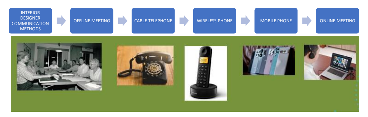
Figure 4 Interior Designer Communication Method Diagram

of digital interior design technology, this makes CAD a very useful tool in creating technical, detailed and accurate drawings, and is also able to create innovative designs. Efforts to face society 5.0 require us together to think in terms of design in realizing a visual work. The concept of society 5.0 is expected to bring about even better changes. Therefore, interior designers in facing society 5.0 can integrate machines and artificial intelligence which is believed to help humans in making work easier more optimally. So, people can focus on creating innovations and being creative with new ideas more actively. The following diagram shows how interior designers can communicate through several machines easily, starting with offline and continuing online.