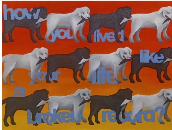
Figure 2. mammon